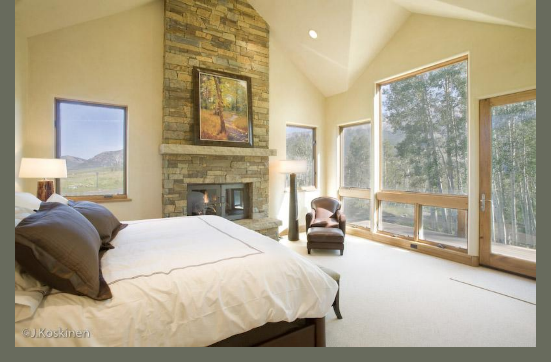
The Guest Master suite is on the main level of the house. It enjoys views of Dallas Peak and Iron Mountain from its private deck