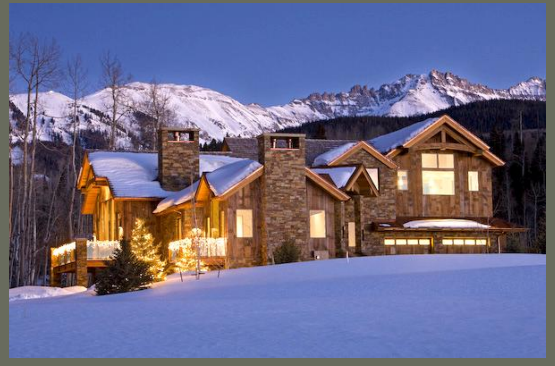
The Great Room, Guest Master and Family/Media Room all face Dallas Peak and the mature aspen forest