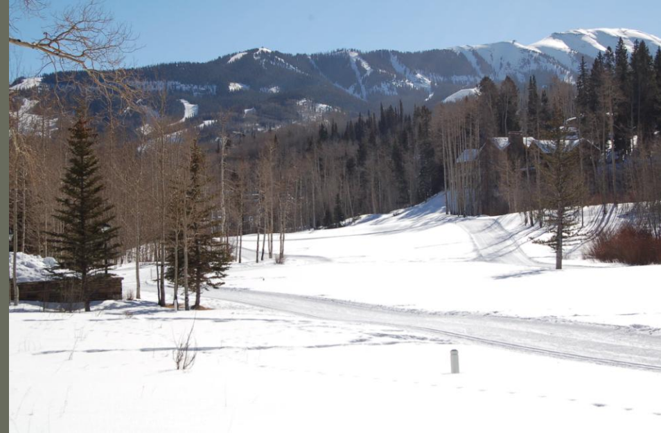
Winter, Spring, Summer or Fall, the views from Fairway Lodge are spectacular!