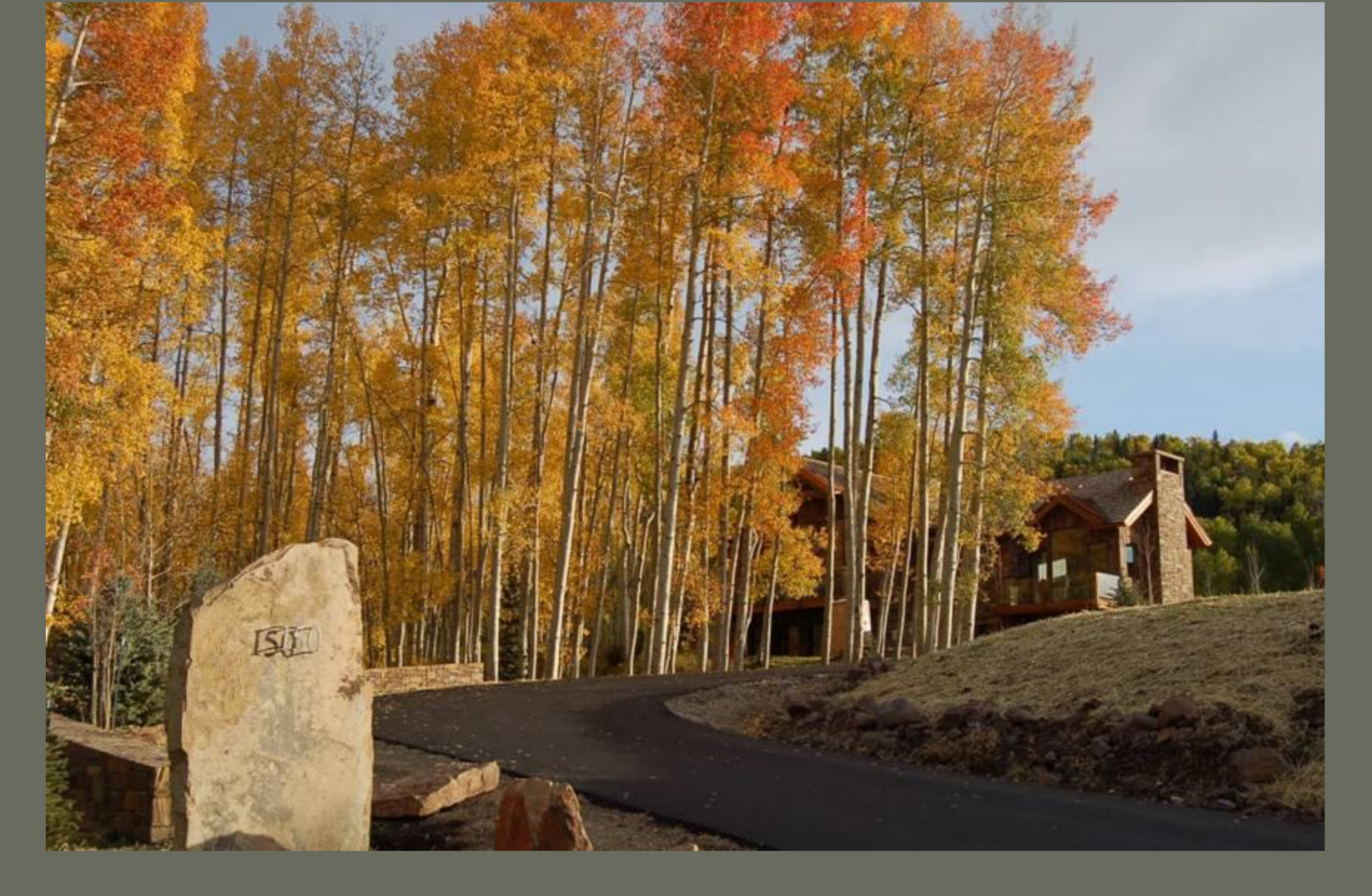
The home is situated on a very private lot, 314 ft deep, adjacent to Fairway 15