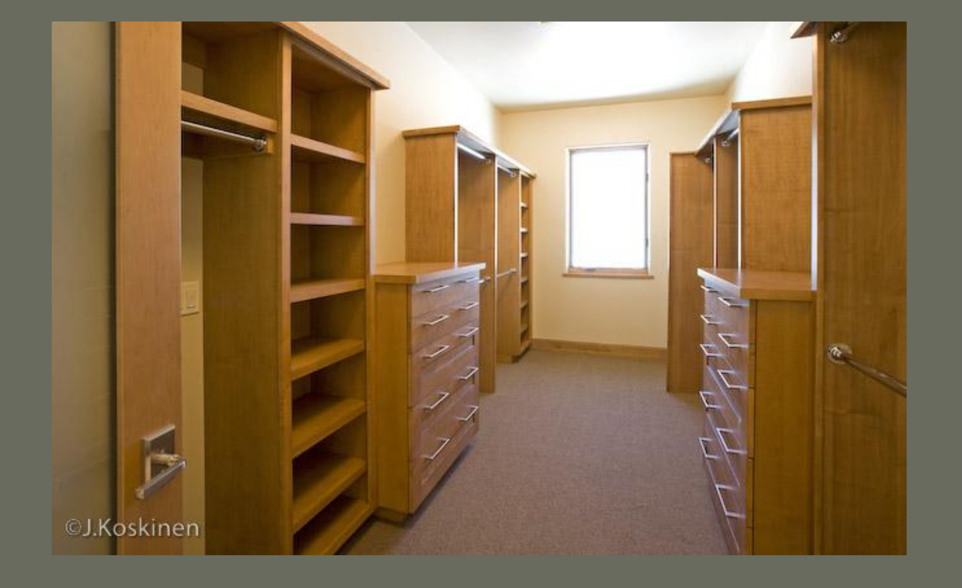
The Master closet is spacious, with many built-ins and plumbing for optional washer/dryer