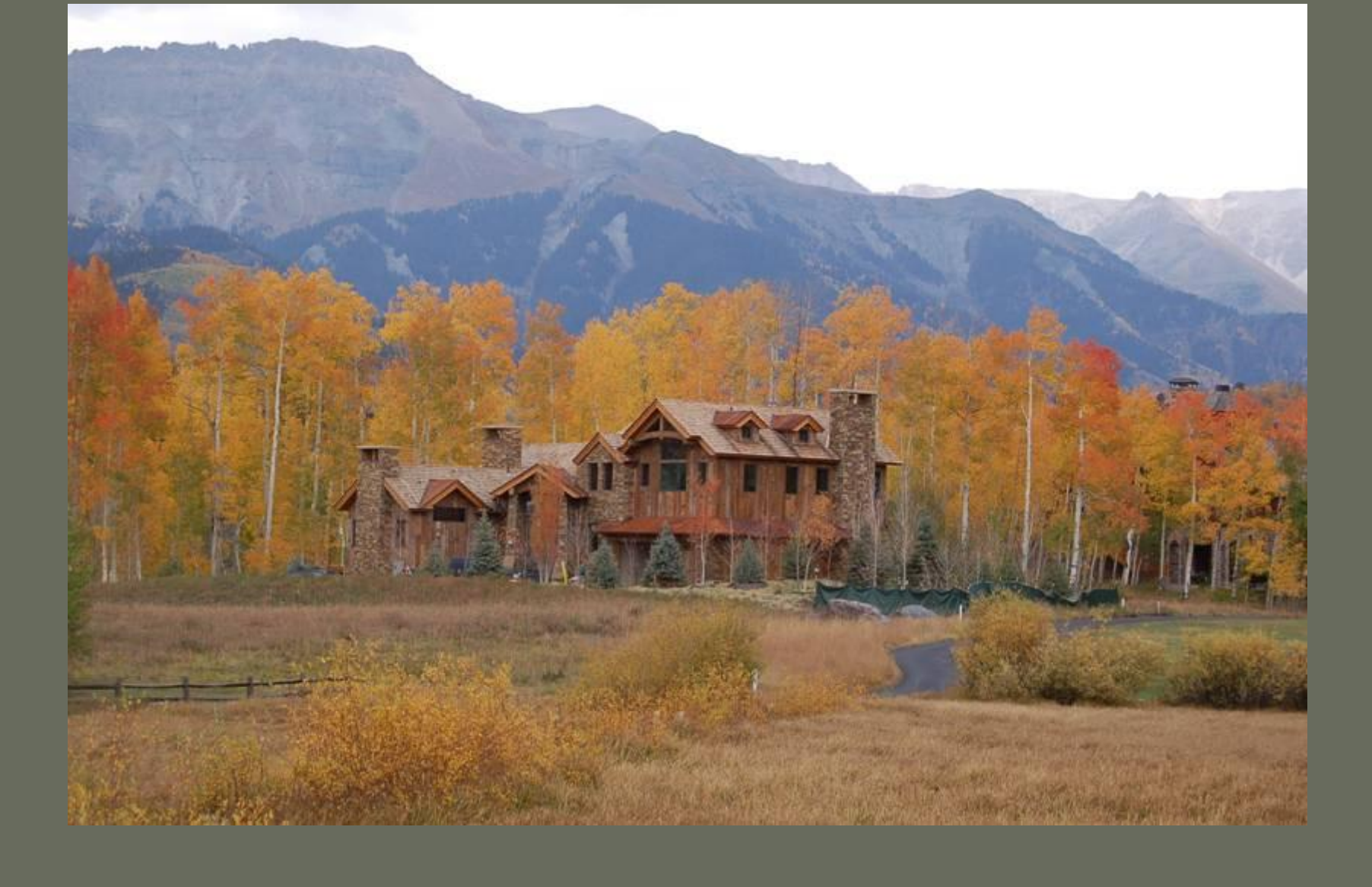
Fairway Lodge was designed by Jamie Brewster McLeod, AIA of Aspen/Telluride and blends beautifully into the surroundings